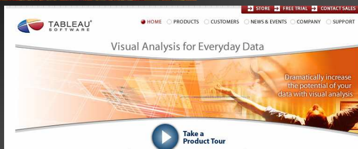
Tableau Web Site